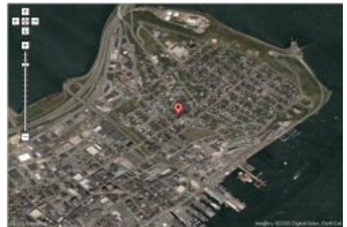
Our apartment seen from space...