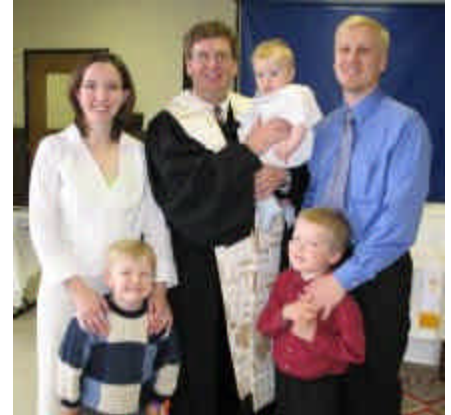
May 22 nd , 2005 Christ the Redeemer Presbyterian Church