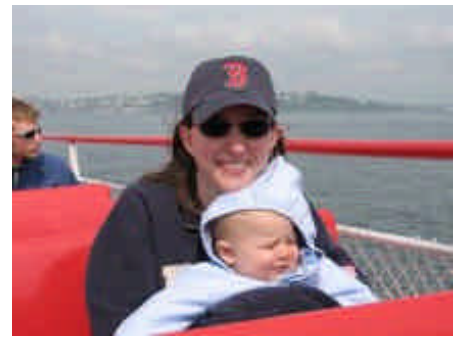
Scotty's first boat ride taken on the ferry to Peaks Island (we live on the bump behind Beth's head)

(And yes, the weather has improved - it is currently 79° and sunny.)